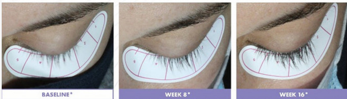
CLINICAL STUDY PARTICIPANT A, AGE 36

With more pronounced results at 16 weeks.*