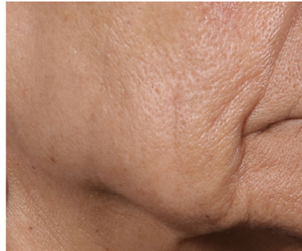
Day 90 Post 1 Treatment

Each treatment removes up to 8% total surface area of skin with microscopic skin punches that close within hours leaving a tighter, more lifted appearance of skin on the nasolabial folds, cheeks and jawline.